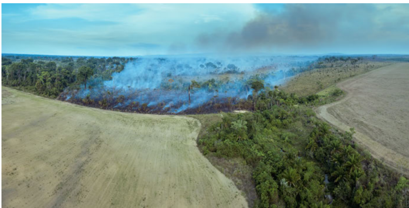
Photo: Illegal fires burn forest trees in the Amazon rainforest, Brazil. This image shows an aerial view of deforestation connected to soy and livestock farming.

Finally, these scenarios were combined to discover the climate change and environmental impacts when people 'eat less and better', meaning they not only eat less chicken and pork, they also choose higher welfare meat when they do.