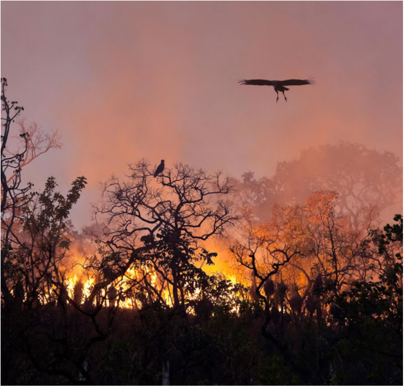
Photo: Bird of prey flying over fires, during the peak of the dry season, Chapada dos Veadeiros National Park, Cerrado region, Goias, Brazil. Fires in animal feed production hotspots like Cerrado are commonplace, unlocking carbon into the atmosphere and destroying wild animal habitats.

World Animal Protection is sharing results from the world's first study to measure the potential climate and environmental benefits of eating less factory farmed chicken and pork, while simultaneously ending the cruellest practices on factory farms and improving living conditions for the billions of animals currently trapped within them.