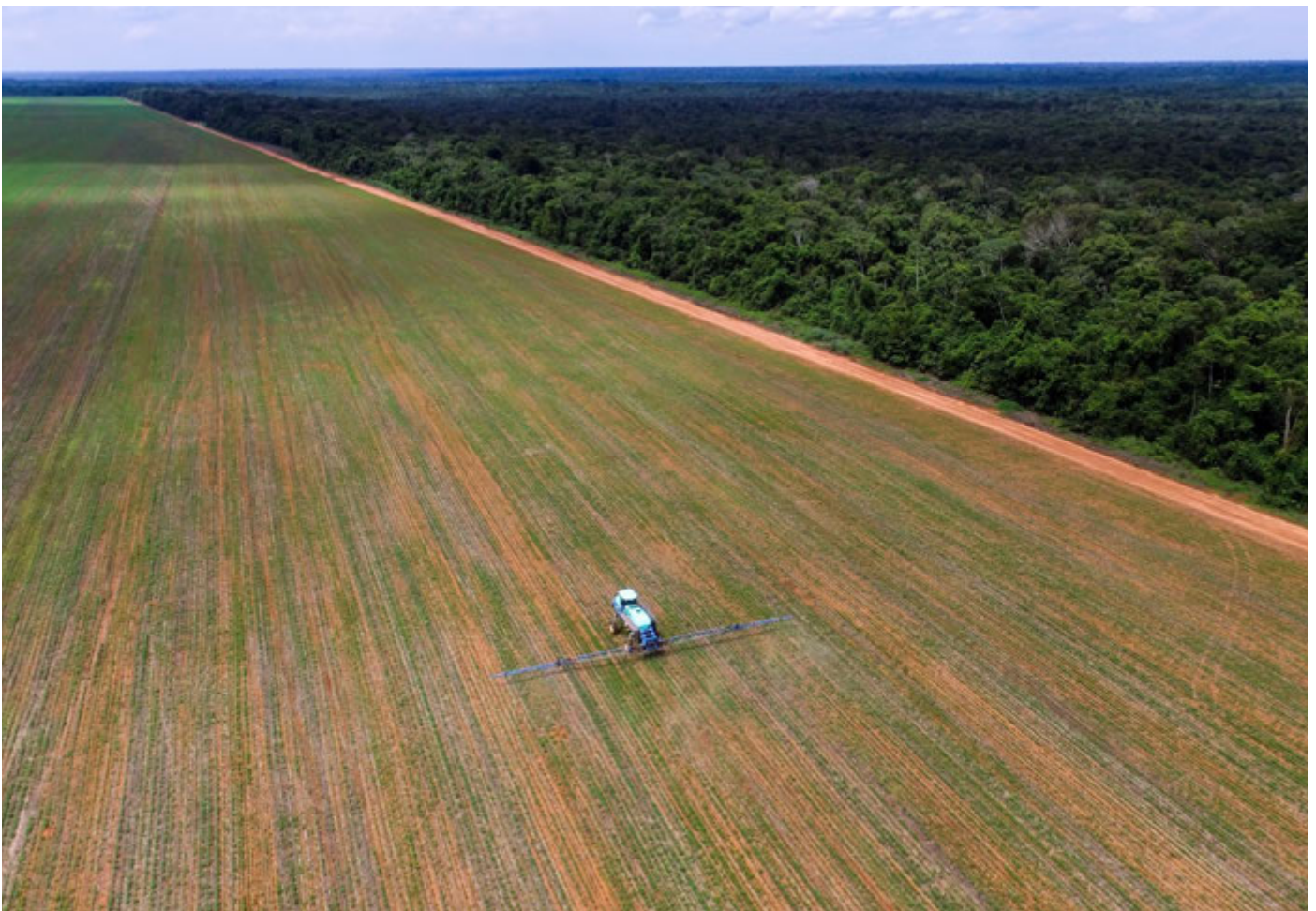
Photo: Pesticides are sprayed onto soy crops in Brazil, adjacent to forest. The biggest climate change and environmental impacts within the factory farming system are created by the production of crops used to feed farmed animals.

We need a moratorium on factory farming now.