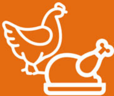
Figure 2. Current toll of factory farmed chicken and pork on our climate