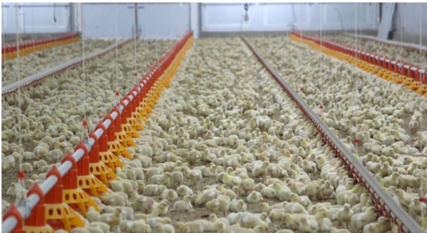
Photo: Factory farming is pushing our climate to breaking point. Huge amounts of natural resources are needed including energy i for heating, lighting and ventilation. This image shows 7-day old meat chickens.

The global factory farming industry is strong and powerful. Our research provides the compelling case for governments to address the problem and impose a moratorium on factory farming. This means that no new factory farms should be built for the next ten years whilst regulations catch up, to ensure that factory farming big business is held accountable for the damage it does to animals, people and our planet.