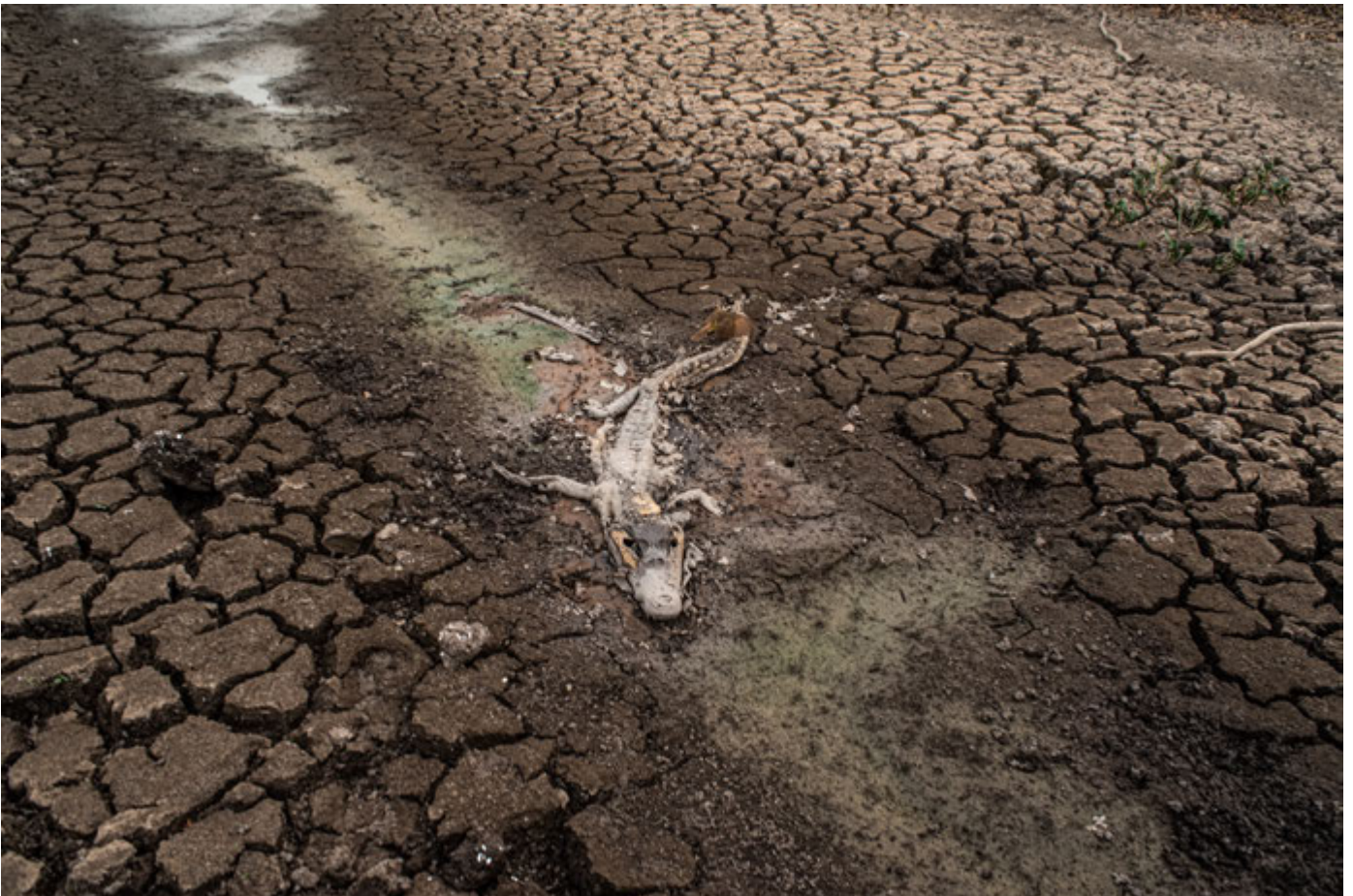
Photo: An alligator killed by the drought and forest fires that hit the Pantanal in 2020 in Brazil. The production of animal feed crops can be very damaging to water supplies, using large quantities in regions already suffering from scarcity. Through use of fertilisers and pesticides, it also pollutes rivers that people and animals rely on. Credit: Lucas Ninno / Getty Images