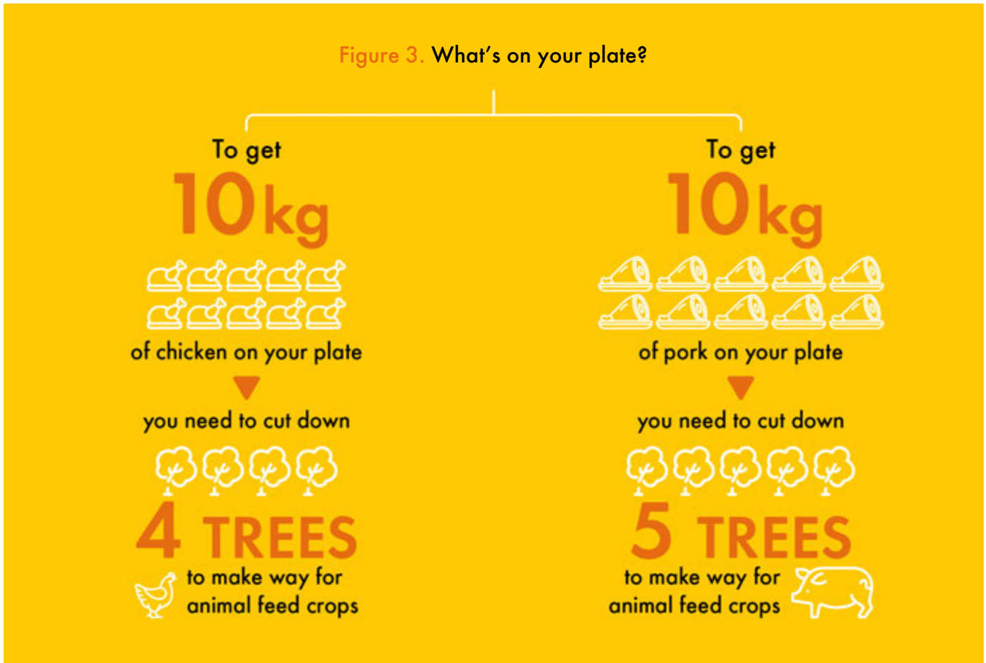
Figure 3. What's on your plate?