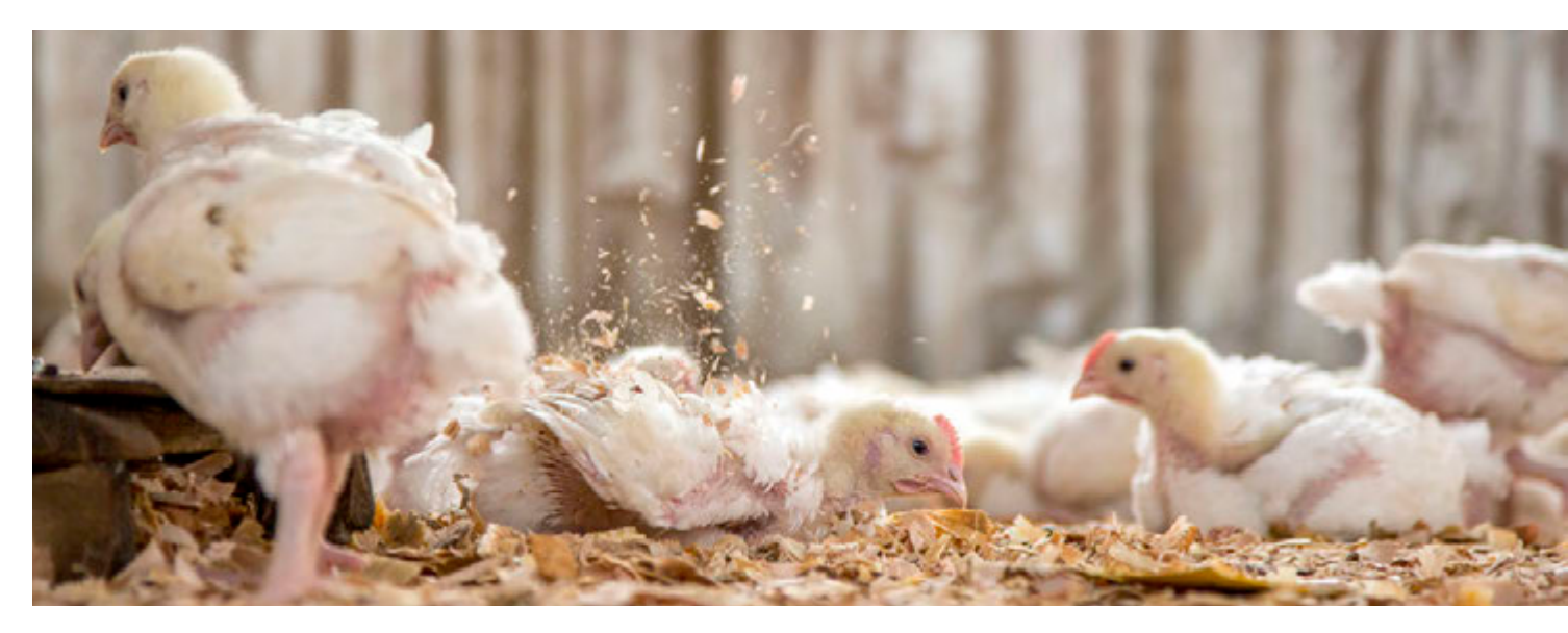
Image: 19-day-old broiler (meat) chickens in an indoor, deep-litter system typical of independent farms in East Africa.