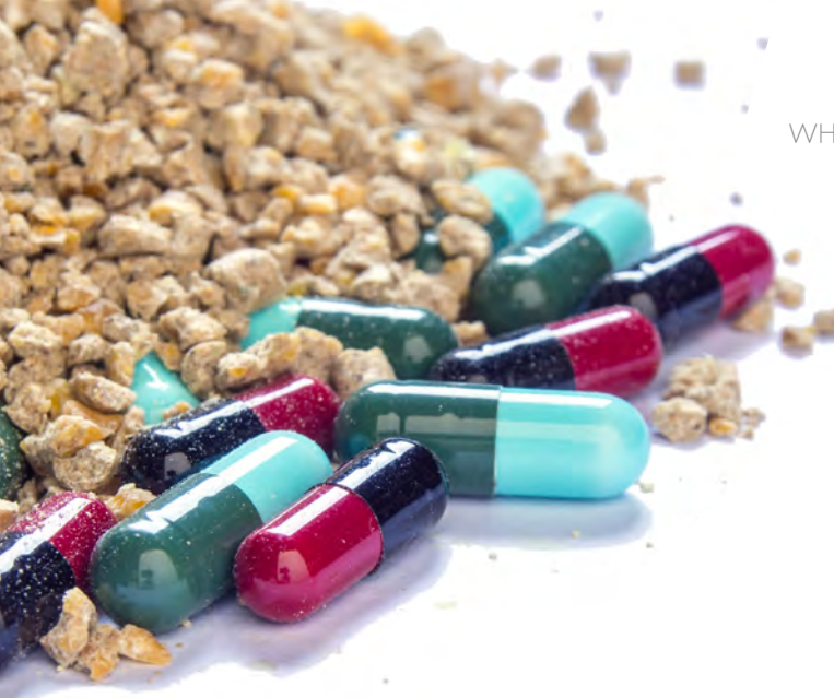
Image: The World Health Organization has warned that intensive farming practices increase the risk of zoonotic diseases.

of the same breeds - all pigs or all poultry for example - are kept at high stocking densities, this increases the risk of virulent and mass disease transmission among them.<sup>19 20 21</sup>