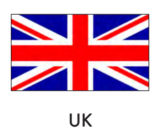
Table 27 'The pecking order 2021' company results snapshot for UK