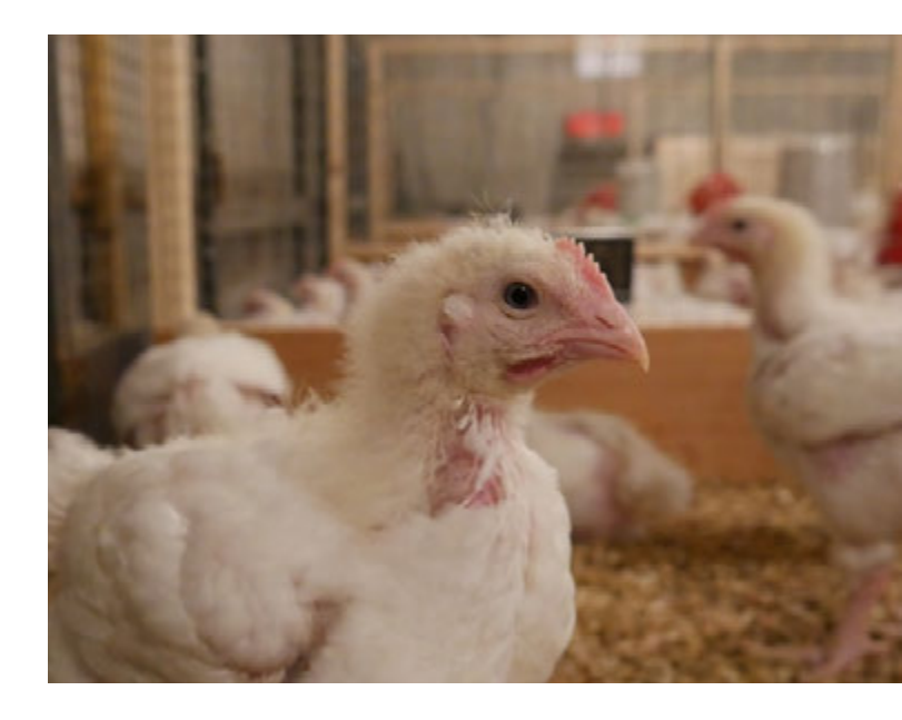
Image: Sixty billion meat chickens are raised for global consumption each year.

Factory farming is clearly unsustainable. Attempts to position chicken as a sustainable meat, by comparing it with beef production are misguided. Although 1 kg of chicken produces fewer greenhouse gas emissions than 1 kg of beef, shifting to chicken production from beef or other animal protein production does not address factory farming risks. It can even exacerbate them.