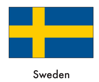
Table 25 'The pecking order 2021' company results snapshot for Sweden