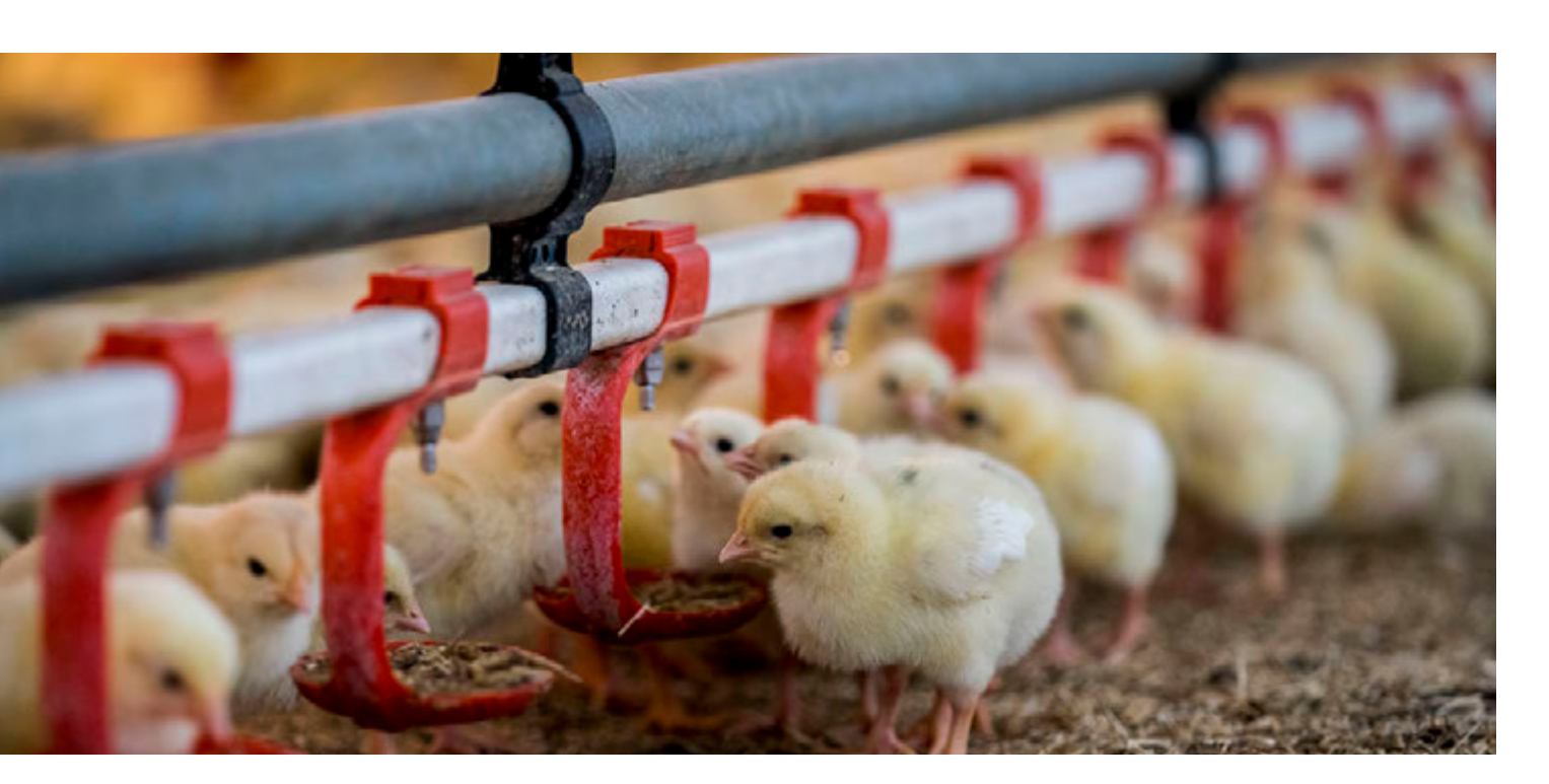
Image: 'Windstreek' is a high welfare chicken farm in the Netherlands It has been built with the welfare of chickens in mind, to ensure they have a good and valued life.

IV. 'The pecking order' results are gathered via independent assessment by Chronos Sustainability. Given the complex business structure of Domino's, however, World Animal Protection gathered the data for all Domino's companies other than Domino's Pizza PLC and Domino's Pizza Inc. For all other brands in 'The pecking order 2021' data gathering was carried out by Chronos Sustainability.